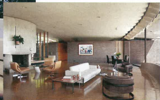
The historic Silvertop, purchased in October by Wood for $8.55 million, has three bedrooms, four bathrooms, a pool and a tennis court and offers panoramic views of downtown L.A. and the San Gabriel Mountains.